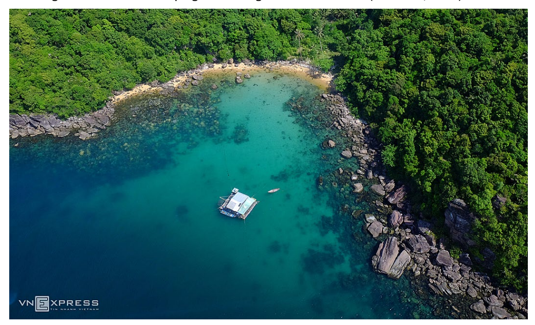
Figure 3: Vietnam tourist hotspot Courtesy: VN Express (Quy, 2021)

Tourism Researchers widely accept the influencing capacity of destination images in the travel decision process. (Hanlan & Kelly, 2008). Researchers elaborated that "Beautiful images attract the potential buyer to the site, keep them engaged with the virtual tour of destinations and represent the multi-dimension views of the landscape." Mondo, Tiago & Marques, Osiris Ricardo & Gándara, José. (2020) investigated the image of Brazil and Rio de Janeiro as a blended tourism destination (TD) image by examining the image categories as positive or negative and cognitive or affective. The availability of information inspires tourists to visit a destination—images and videos of the destination are the most investigated item on the Internet. Pitana and Diarta (2009) validated that Images develop confidence regarding destination and services. Positive images have a favourable impact on deciding to visit the destination—the availability of images on search engines is well executed with the news, articles, and write-ups. Images and identity can influence tourists to visit a destination. Branding of destinations is significant when developing the strategies for Ecotourism. (Cameron, 2018)