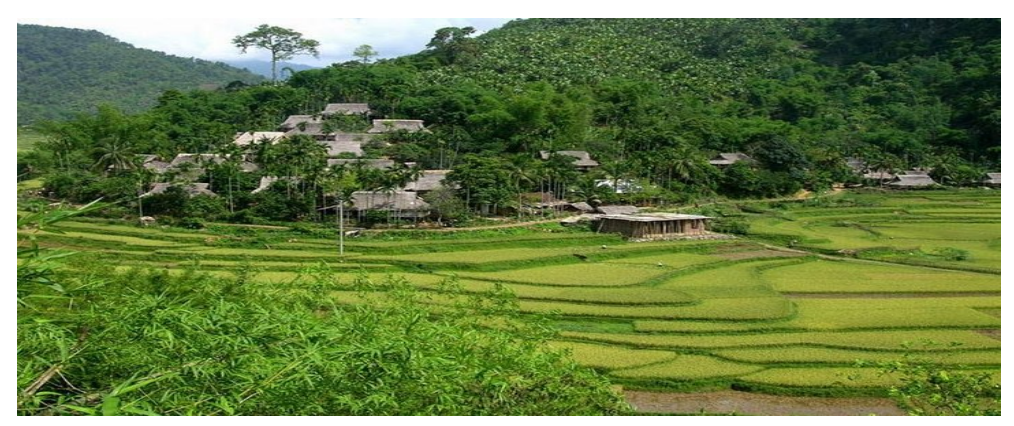
Figure 2: Pu Luong Nature Reserve

Online reviews can make or mar the business with positive and negative reviews. The tourism industry needs to be vigilant about its product line presence, rating, and reviews, as customers prefer to check online reviews about flights, hotels, sightseeing, and tour packages. The Global travel review websites, i.e., Bookings, Facebook, Expedia, Yelp, Hostel World, Foursquare, Airbnb, have multiple followers. Potential customers finalize their product line based on customer reviews, location, pricing, facilities, images, videos and virtual tours. The image drawn from Tripadvsiror represents Vietnam's jungles and monsoon forests in diverse ecosystems alive with unique wildlife.