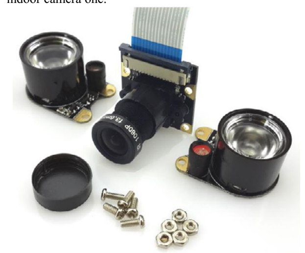
Fig. 3. Raspberry Pi Camera module [18].

There exists a huge amoun of various camery systems for household security provision. The most important attributes of a quality camera is its functionality, placement variety, and also its ability to communicate with other systems. The outdoor camera required attributes set will naturally differ from the indoor camera one.