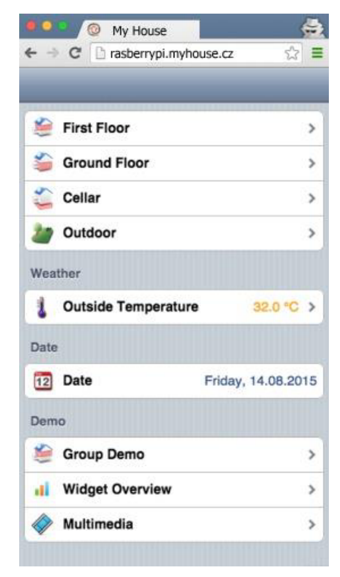
Fig. 5. OpenHab map creation – rooms [4].

This work was supported by the Ministry of Education, Youth and Sports of the Czech Republic within the National Sustainability Programme project No. LO1303 (MSMT-7778/2014) and also by the European Regional Development Fund under the project CEBIA-Tech No. CZ.1.05/2.1.00/03.0089.