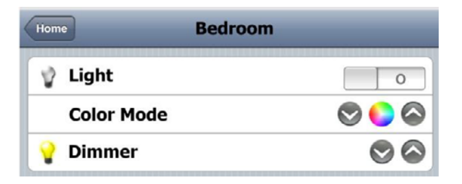
Fig. 4. OpenHab adding items – bedroom [4].

The windows creation description is beyond the scope of this article. Nevertheless, the following figures illustrate resulting windows example.