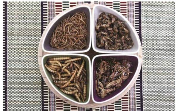
Fig. 4—Comparison of the fat content in field cricket ( Gryllus assimilis ) and animal commodities (Pipek, 1995; Steinhauser, 1995).

Fatty acid profile shown in Table 1 shows that, the largest part is formed by these three acids: C18:2