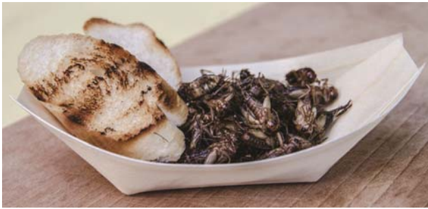
Fig. 3—Comparison of the crude protein content in field cricket ( Gryllus assimilis ) and animal commodities (Pipek, 1995; Steinhauser, 1995).

Fat content in sample 1 was 11.4 % of dry matter and in sample 2 % was 12.3 %. An average fat content in analysed insect was 11.9 \pm 0.5 %. This