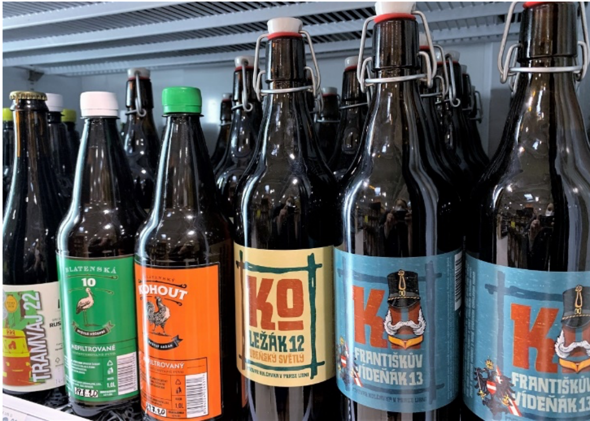
Figure 3 Beer from microbreweries.