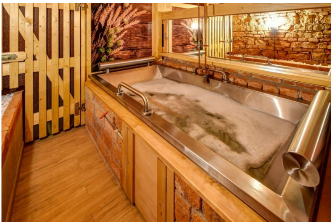
Figure 1 Beer spa Černý Orel Kroměříž (Cerny-orel.eu, 2021).