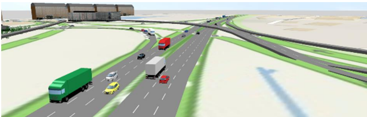
Fig. 13 – Detail of exit of LKW vehicles on highway.