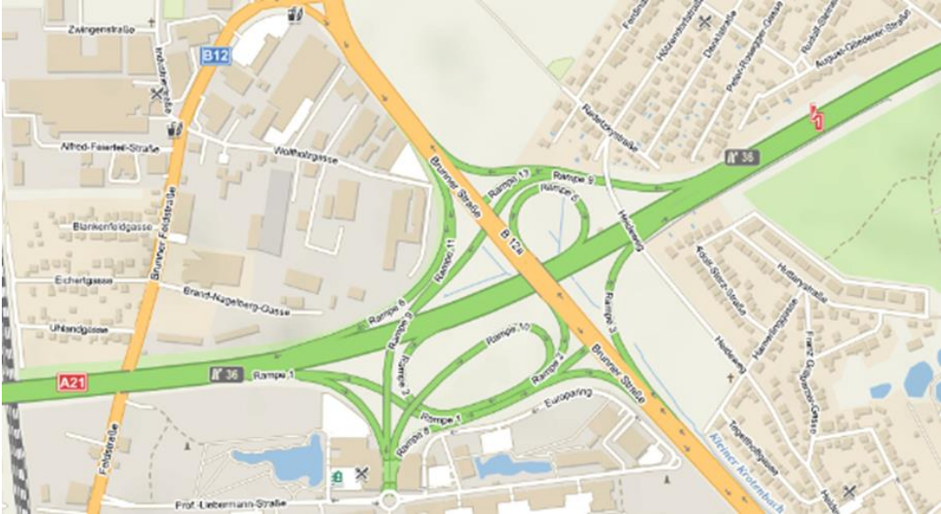
Fig. 2 – Map background for crossing A21 and B12a.

The elevated crossing of the A21 motorway and the B12a road is located east of the town of BrunnamGebirge, in the province of Lower Austria and near the border with Vienna. This crossing mainly serves to connect the A21 and B12a roads mentioned here. Furthermore, this crossing serves as an arrival to Europaring, where there are various companies and hotels. In addition, the ultimate and essential purpose of this crossing is the arrival of vehicles from the A21 motorway to the already mentioned town of Brunn am Gebirge. (Asfinag, 2019)