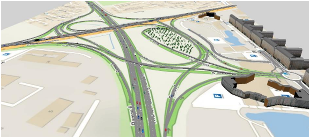
Fig. 9 – General view from the west.