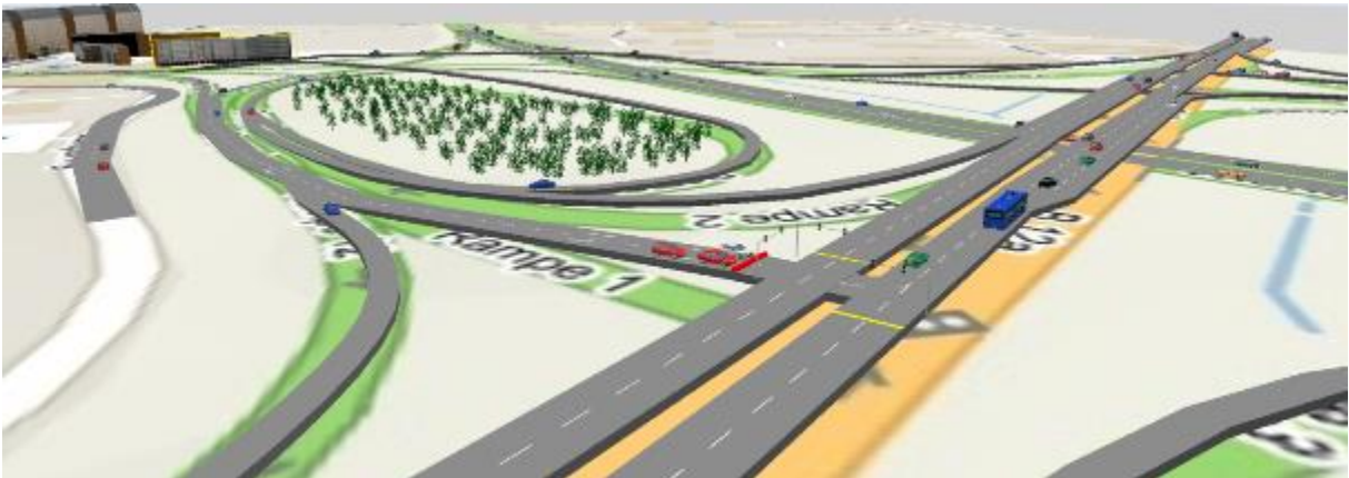
Fig. 7 – Detail of traffic lights.