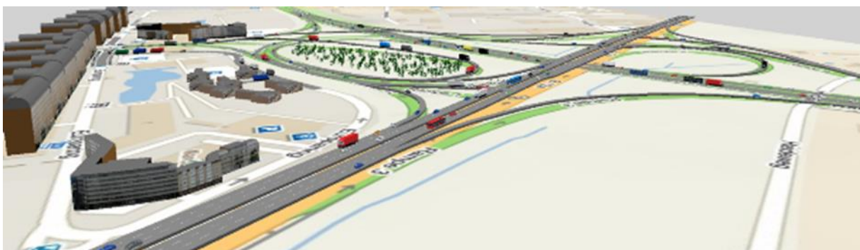
Fig. 14 – A view of a variant with a logistics centre from the southeast.