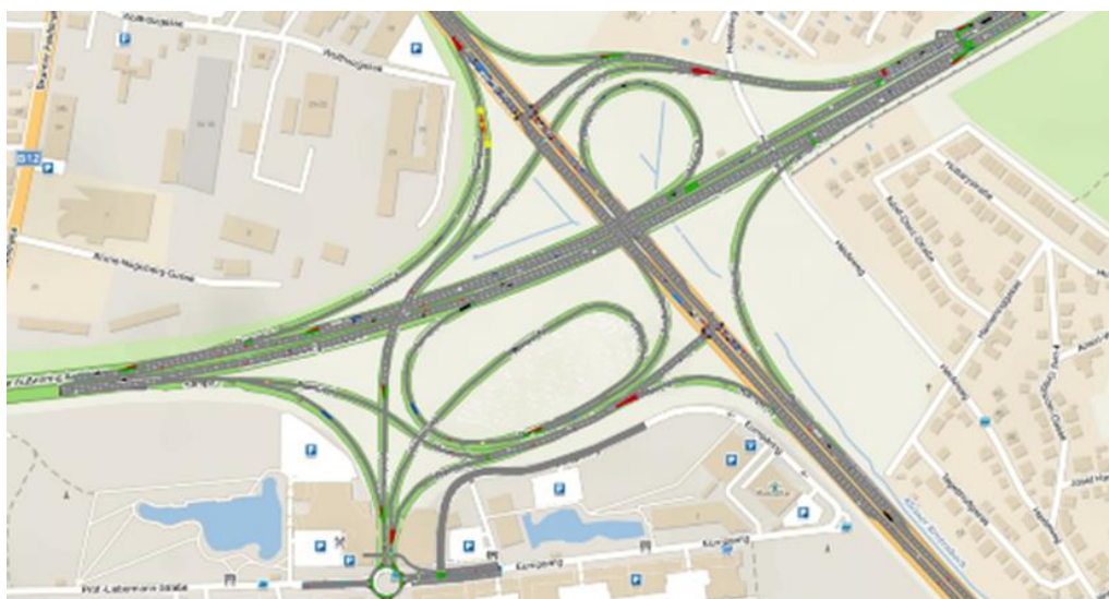
Fig. 5 – General view of crossing in Vissim.