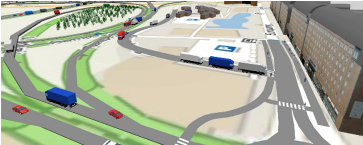
Fig. 11 – LKW vehicles leaving the distribution warehouse.