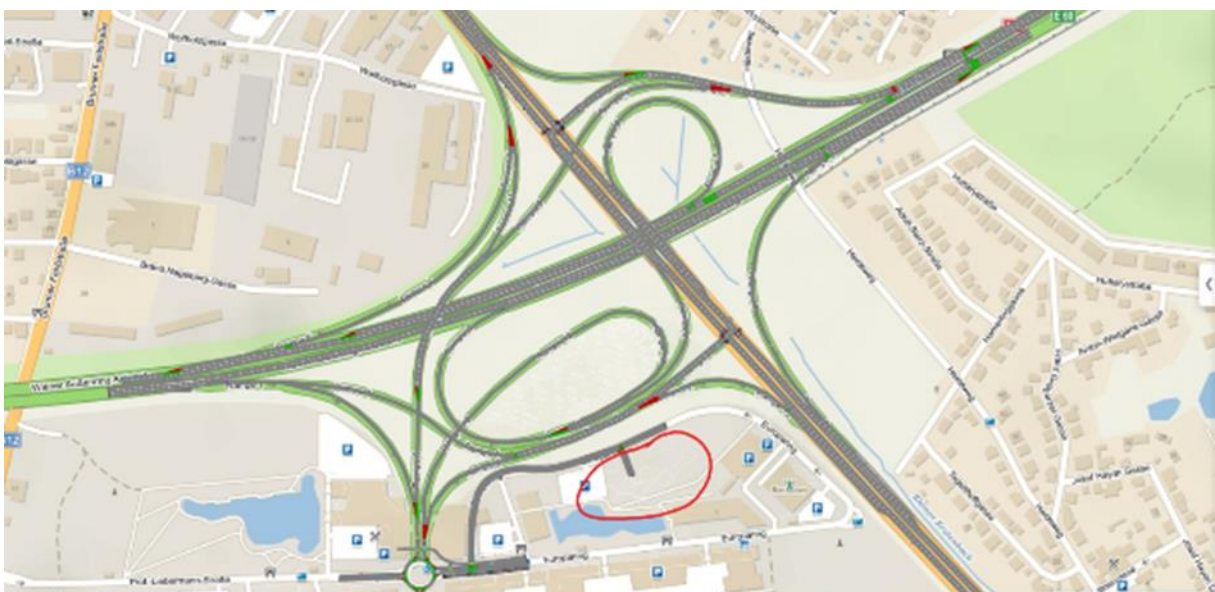
Fig. 10 – Location of the logistics centre.

According to the author, no or relatively low traffic deterioration is mainly because the logistics centre is located just at this grade-separated crossing, which means excellent accessibility to the main roads, in this case, the A21 motorway and the Brunner Straße B12a. It is the worsening traffic and availability on the main routes that are one of the essential points in the construction of the logistics centre. This warehouse location fulfils both of these aspects.