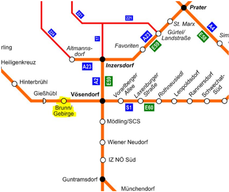
Fig. 3 – Location of crossings in the road network.

This grade crossing is very complex. It consists of 13 so-called Ramps, which are used to connect the surrounding roads, and due to the use of connecting lanes, there is no excessive formation of columns, and traffic is thus smooth. However, there are also two traffic lights, both when connecting Ramp 1 to Brunner Straße (B12a) and Ramp 13 to Brunner Straße. At the exit of Europaring, there is also a roundabout. (Asfinag, 2019)