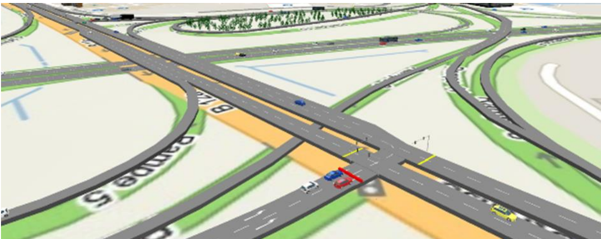
Fig. 8 – Flyover detail.