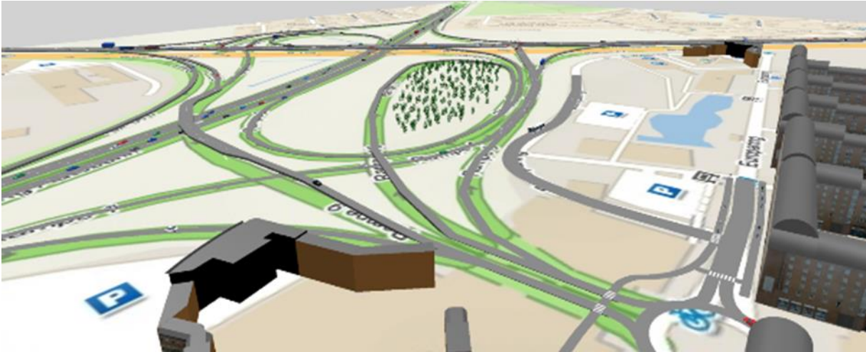
Fig. 6 – General view of the crossing from the northwest.