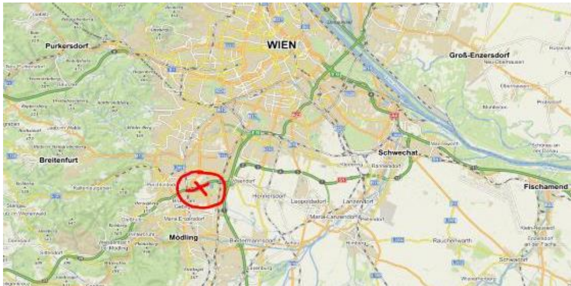
Fig. 1 – Location of grade crossing.

The next part describes in detail the roads that this work covers. In the first place is described the most crucial highway, which is part of the grade crossing, namely the highway A21, then the road B12 and ultimately directly grade crossing these roads.