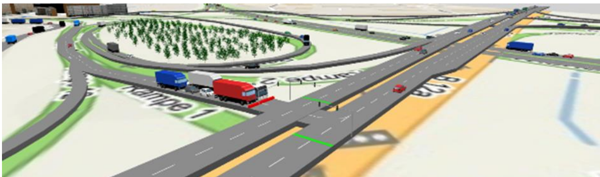
Fig. 12 – Detail of traffic lights with LKW vehicles.